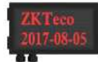
LPR-Display Screen (Optional)